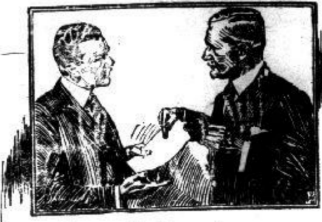
A businesslike Answer to a businesslike Question

THIRTY denominations cooperating in the Inter-church World Movement have budgeted their needs. No business could have done it more scientifically.