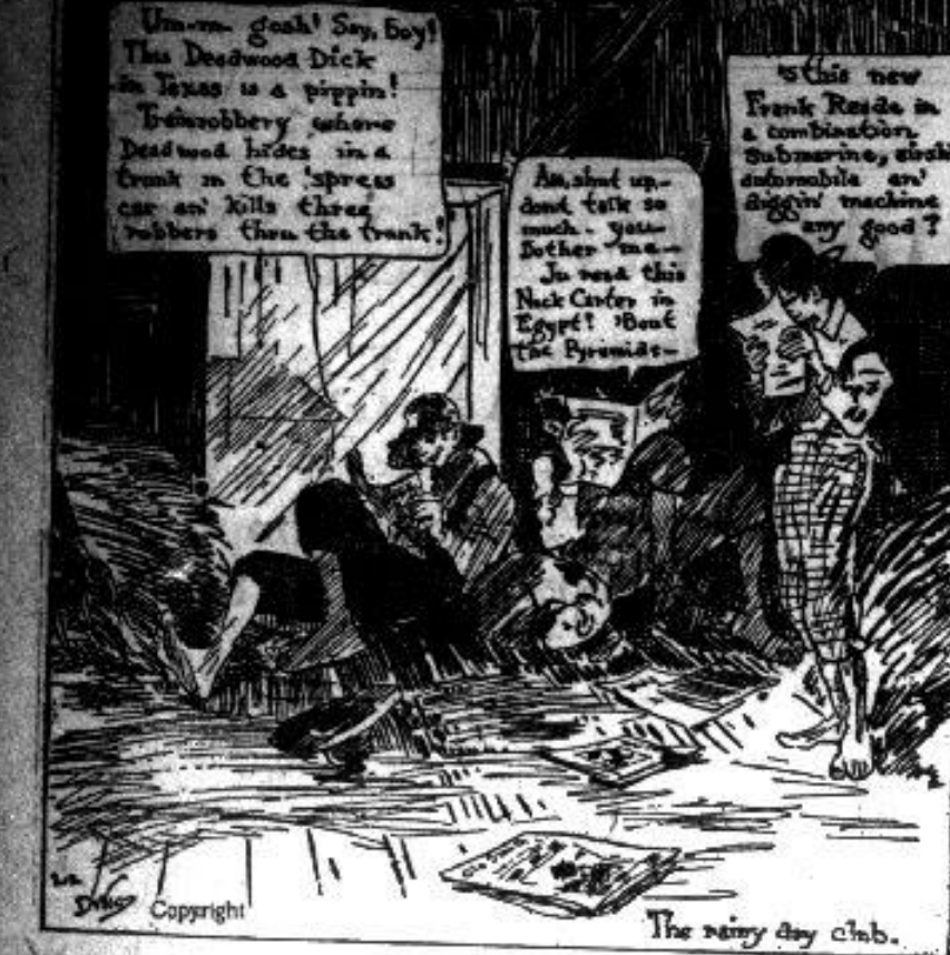
What They Mean