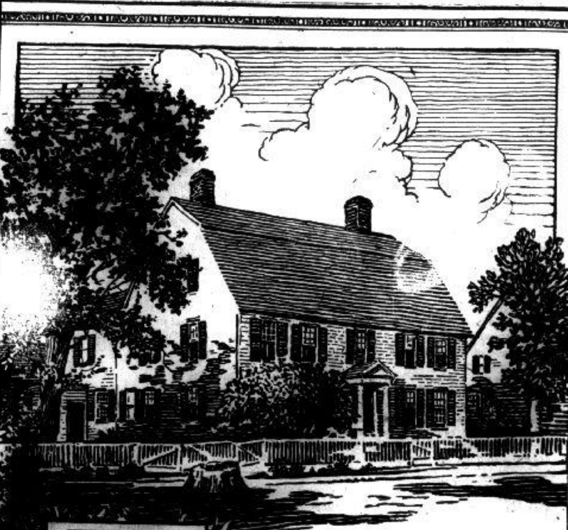
Webb House, Wethersfield, Conn., in which, on May 21, 1781, Washington and Rochambeau planned the siege and capture of Yorktown.

FROM Wethersfield, Conn., to old Provincetown, down on the Cape, and from there to Niagara Falls—over the city boulevards and all along "the trail"—you can find the familiar Socony sign.