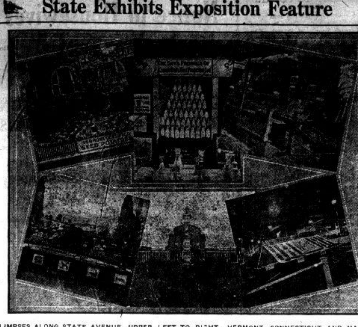
GLIMPSES ALONG STATE AVENUE—UPPER, LEFT TO RIGHT, VERMONT, CONNECTICUT AND MAINE—LOWER, LEFT TO RIGHT, NEW HAMPSHIRE, MASSACHUSETTS STATE BUILDING AND RHODE ISLAND