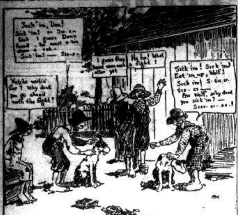
A sporting event