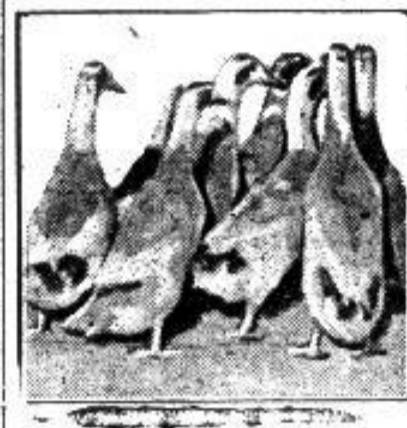
Indian Runner Ducklings

PRODUCTION OF DUCKS' EGGS Demand at Good Prices is Limited Except Around Easter—Indian Runner is Favored.