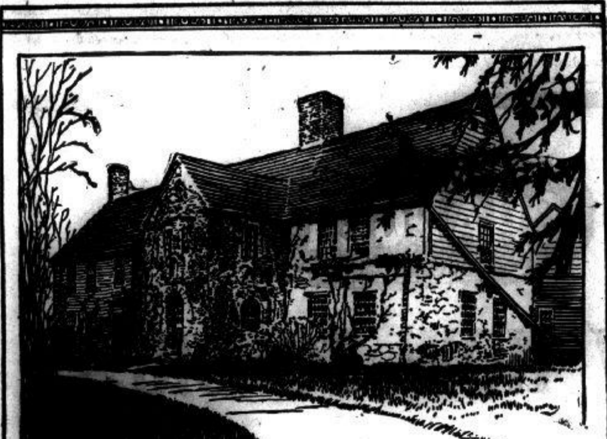
Spencer-Pierce House, Newbury, Mass. This ancient stone house was built some time between 1655 and 1661.

Every motor highway and byway throughout picturesque New England and New York is a part of the long "Socony Trail".