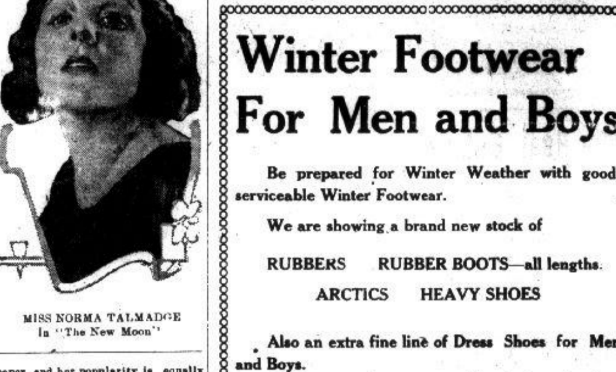
MISS NORMA TALMADGE in "The New Moon"

When local moving picture lovers go to the Orlino Theater Wednesday February 10, to see "The New Moon" they will have an opportunity of witnessing one of America's most popular stars in the feature roll.