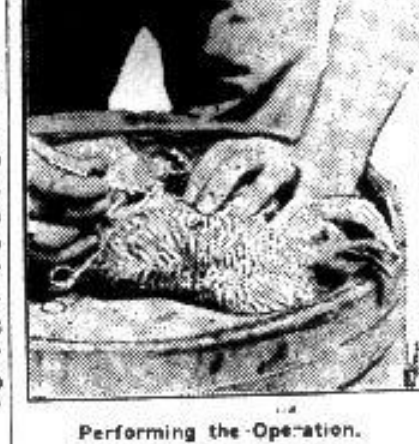
Performing the Operation.

ONE DAVENPORT overstuffed with fine Tapestry covering, loose Spring Cushions on Spring edge, bottom and outside of back covered. $225. Sale price $135. CHAIR to match above Davenport reduced from $127.50 to $79.50. WING DAVENPORT high back, loose Spring cushions with extra quality tapestry covering. Feb. sale price $198 was $350.