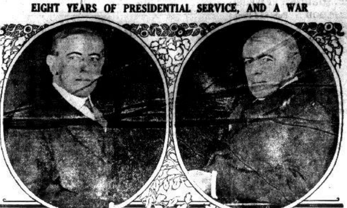
Eight Years of Presidential Service, and a War

Harvards of war are far-reaching. These two pictures of the retiring president tell their own story.