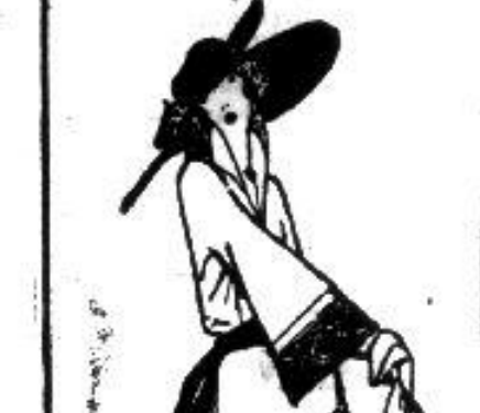
This Model Has an Interesting Trim of Black Linen, a Part of the Pattern of Which is Embroidered.