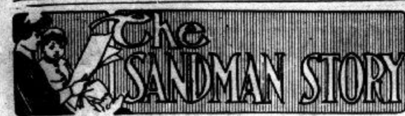
DUCKS FOOL MR. FOX.

ADAM DUCK was tired of swimming, so he scrambled up the bank to look for bugs in the soil by the side of the river. He was waddling slowly about, when all at once he espied a pair of bright eyes peering at her through the tall grass.