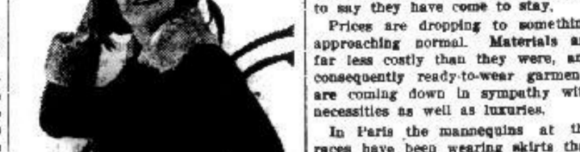
Straight Lines Are Conspicuous on the Fall Suit Models That Have Made Their Appearance.

The new line is to make many of the sleeves long and straight and wide, and set in ampieles that almost succeed in reaching the waistline.