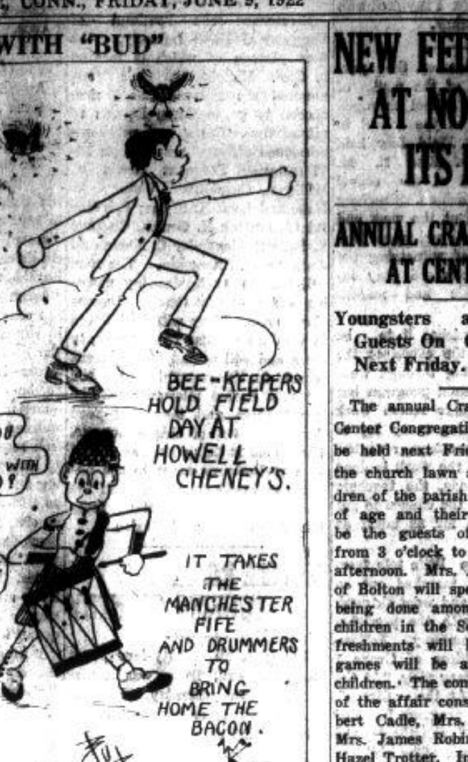
IT TAKES THE MANCHESTER PUFF AND DRUMMERS TO BRING HOME THE BACON.