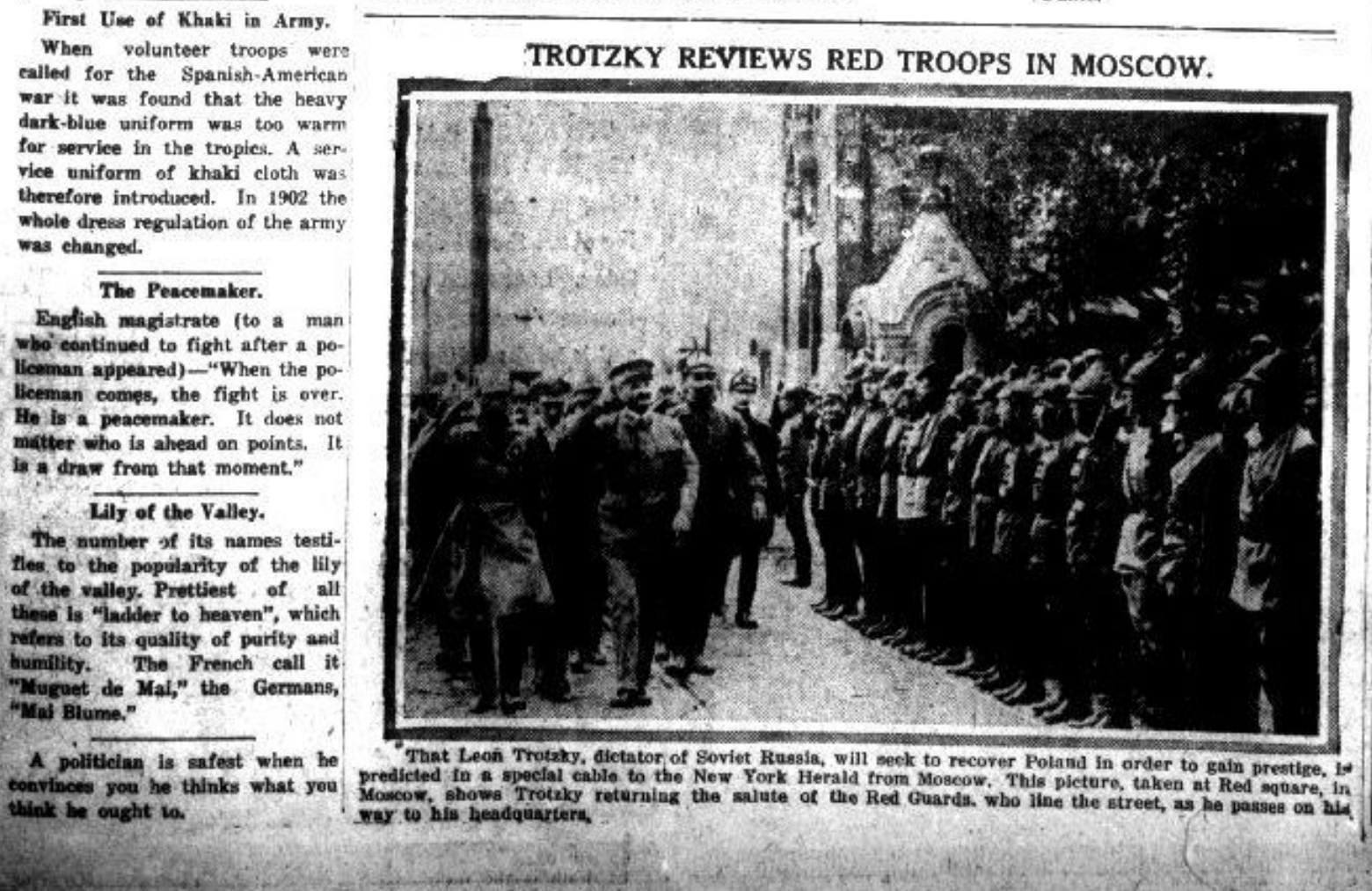
That Leon Trotsky, dictator of Soviet Russia, will seek to recover Poland in order to gain prestige, is the opinion of the New York Herald Tribune. This picture shows Trotsky returning the salute of the Red Guards, who line the street, as he passes on his way to his headquarters.

TROTSKY REVIEWS RED TROOPS IN MOSCOW. English magistrate to a man who mentioned to fight as a policeman appeared.—"When the policeman comes, the fight is over. He is a peacemaker. It does not matter to a policeman if a man is a draw from that moment." Lily of the Valley. The number of its names testify to the popularity of the Lily of the valley. Prettiest of all these is "lady to heaven", which refers to its quality of purity and whiteness. The French call it "Lily of the valley", the German, "Lily of the valley". The Peacemaker. English magistrate to a man who mentioned to fight as a policeman appeared.—"When the policeman comes, the fight is over. He is a peacemaker. It does not matter to a policeman if a man is a draw from that moment."