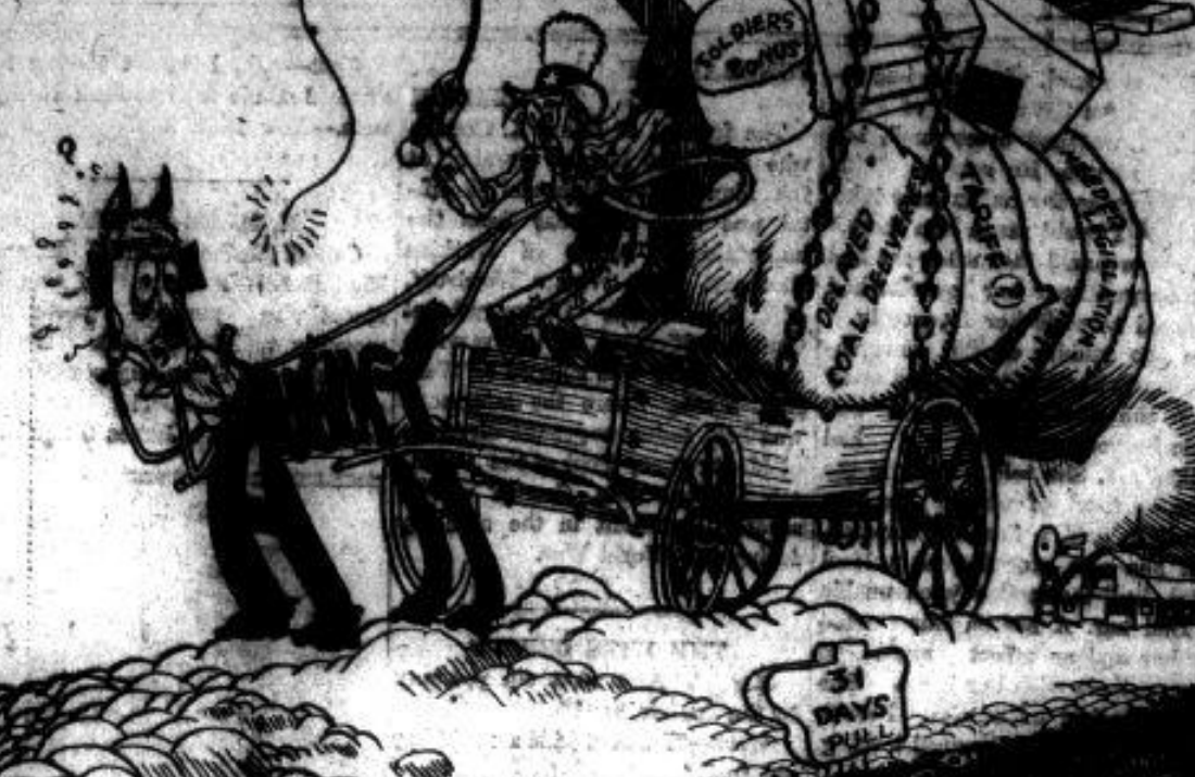
...the day, he... ...the day, he... ...the day, he...