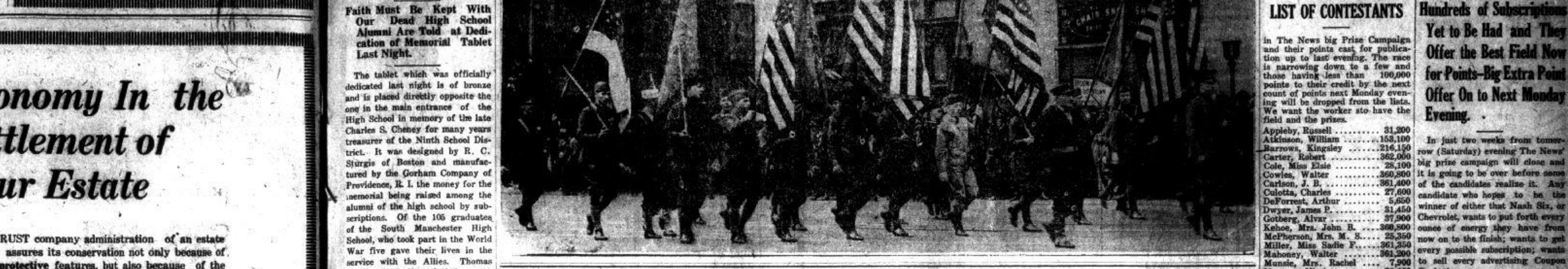
THE BOYS AND THE FLAGS THAT WON THE WORLD WAR IN ARMISTICE DAY PARADE