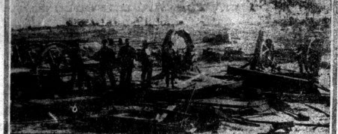
Six persons were killed and over a score injured when a tornado swept across the richest part of the Drumwright-Cushing oil fields at Drumright, Okla. Property damage is placed above a million dollars. One hundred and thirty-four oil well derricks were destroyed by the storm in addition to wrecking power lines and two large vacuum gas plants. The number rendered homeless when thirty-one dwellings were destroyed is estimated at 150. Photo shows one of the 134 oil derricks wrecked by the cyclone.