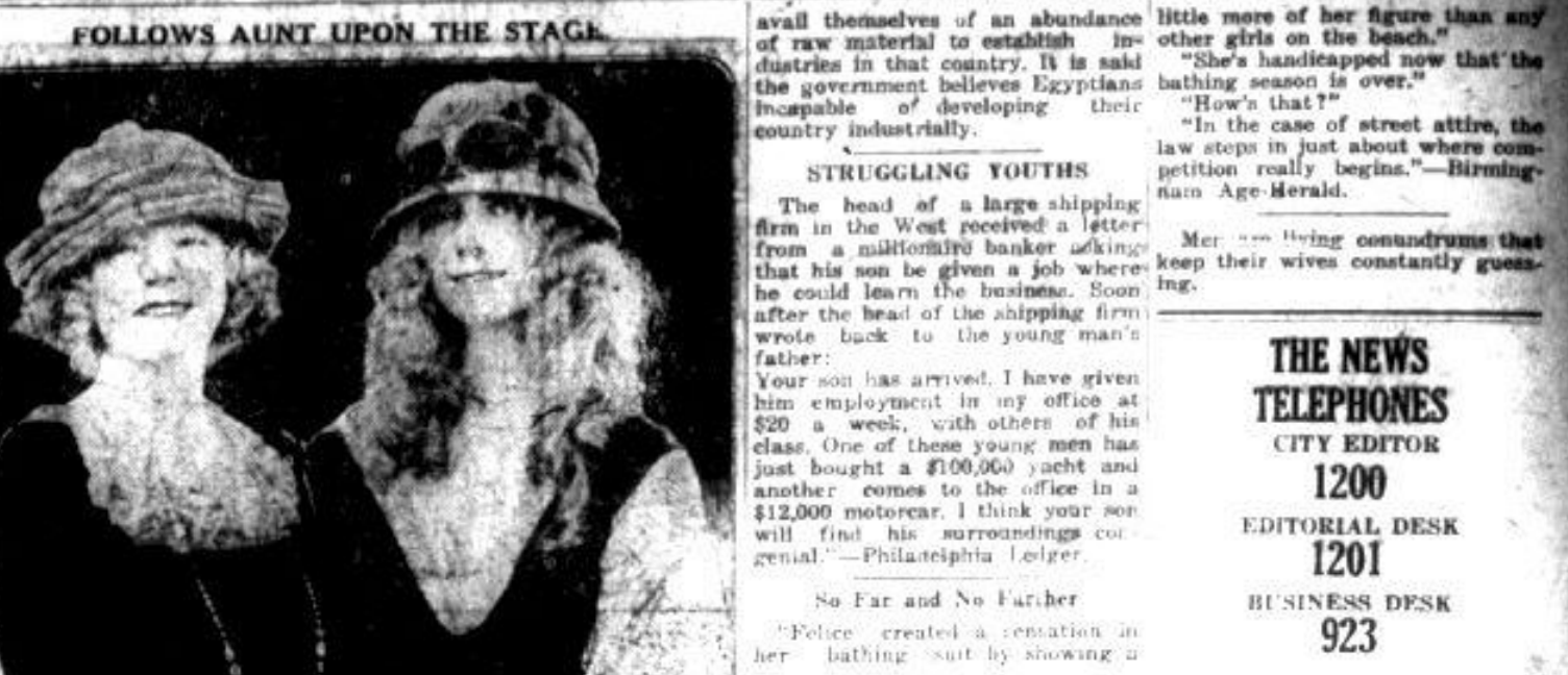
FOLLOWS AUNT UPON THE STAGE

Local Theater Man to Open 30-Room Hostelery at Myrtle Beach—Will Give Place Personal Management.