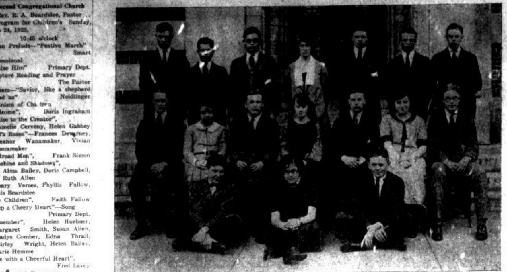
STAFF OF SOMNATHIS EVENTS

ST. MARY'S CHURCH Services as usual—Sunday, June 23rd—Fourth Sunday After Trinity.