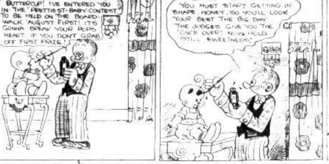
Cartoon illustration of a man and a woman.