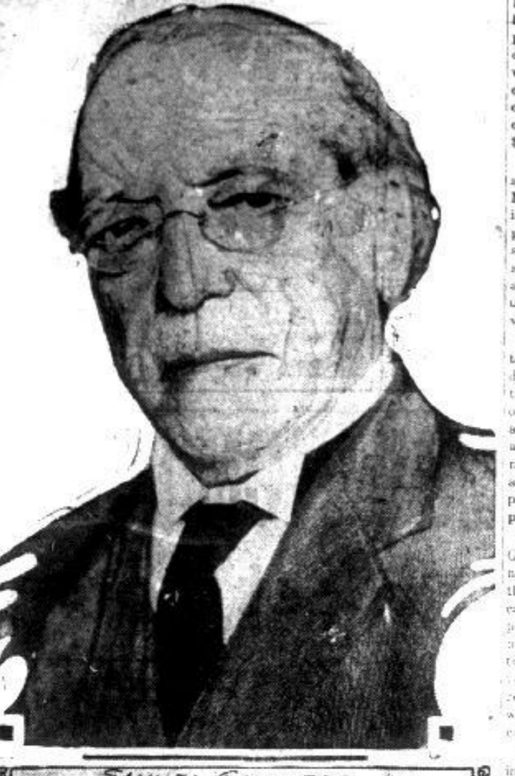
SAMUEL GOMPERS, SECRETARY OF THE AMERICAN FEDERATION OF LABOR.