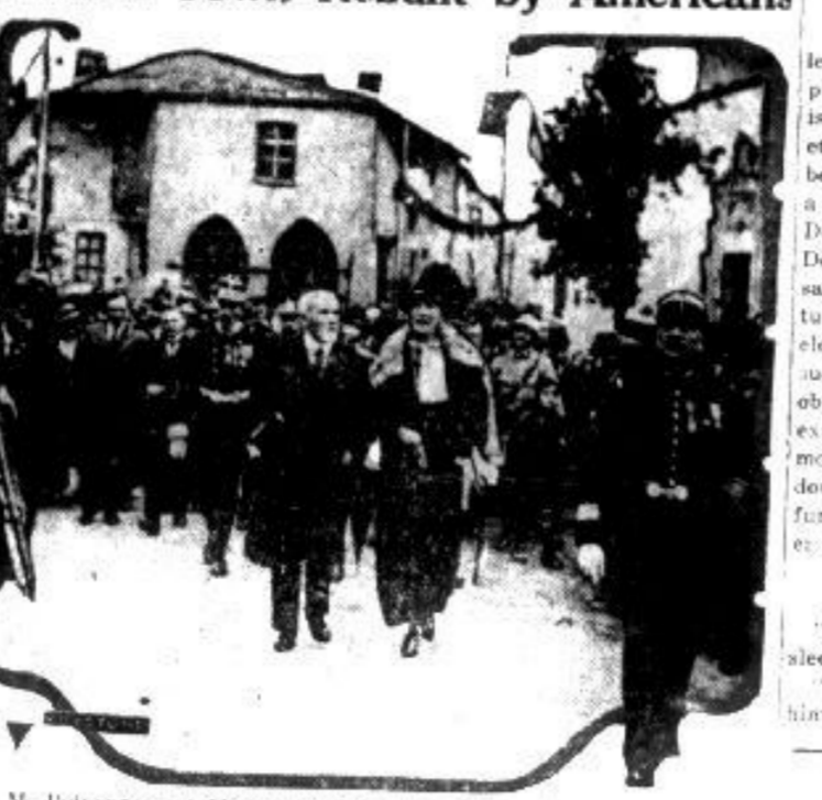
The reconstruction of a town in France, showing the progress of the rebuilding work.

American soldiers and civilians have been instrumental in the reconstruction of a town in France that was destroyed during the war. The town is now being rebuilt with modern buildings and infrastructure, and the community is beginning to flourish again.