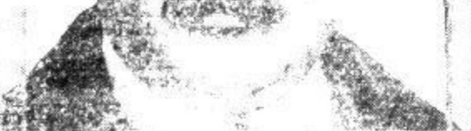
Portrait of a woman.