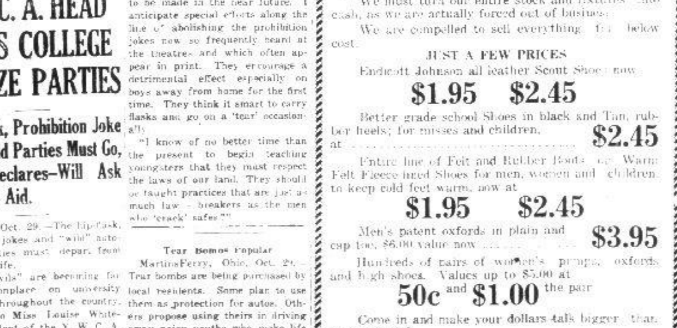
Y. W. C. A. Head.