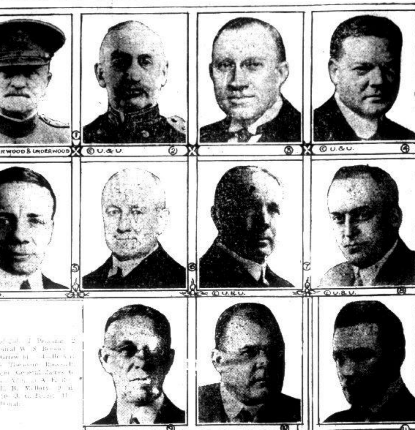
Members of the Marine Show Radio Committee.