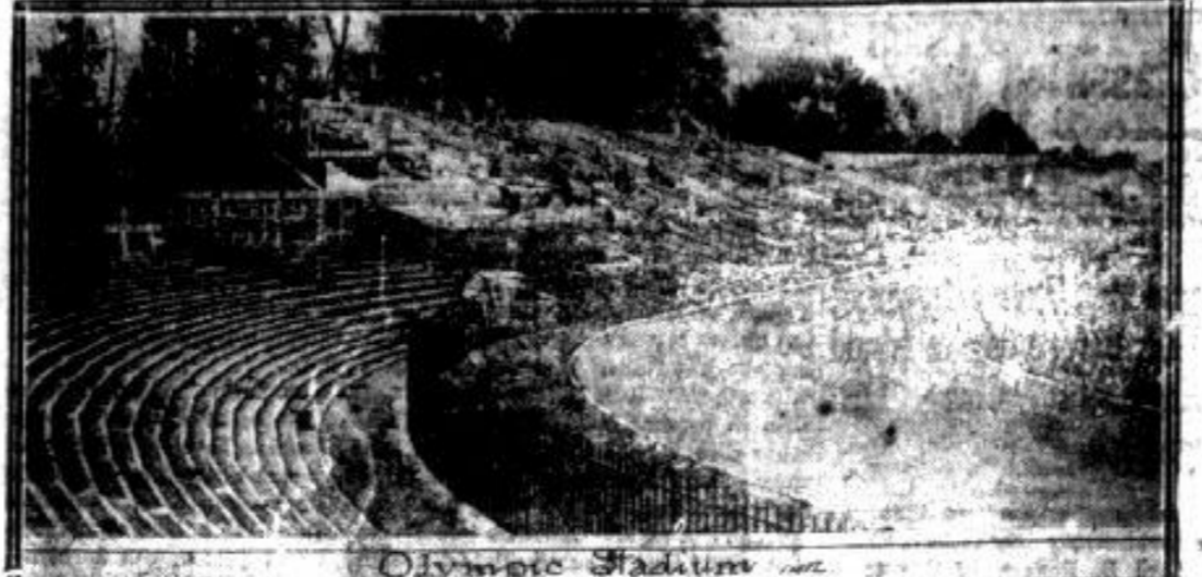
This photograph shows the site at Colonus, just outside Paris, where the new stadium is being erected.

Highlights of the evening's games from the bowling alley at the Colonus, just outside Paris, where the new stadium is being erected.