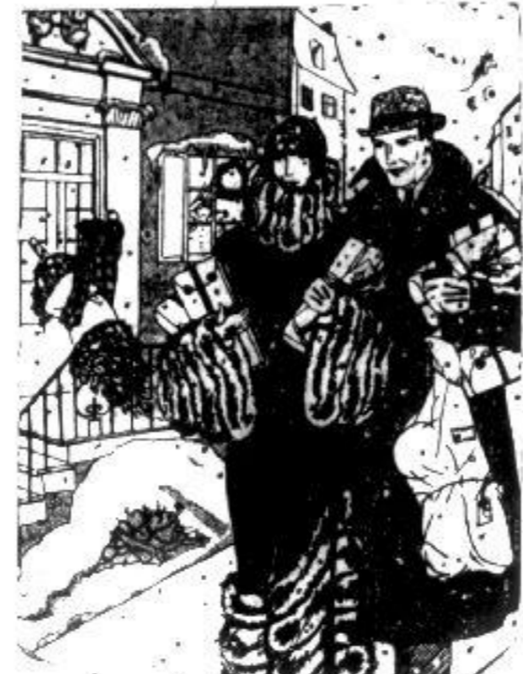
THE CHRISTMAS STORE

It's a fascinating journey you take when you do your Christmas gift choosing here. For there, while after side of the most interesting selection of ready-made gifts for every one in the family and all the friends for making an announcement. And no matter what gift appropriation you have, you can find here a gift that is most appropriate. We don't stop you long enough to make your selections early—the winner the better.