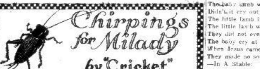
Chirpings for Milady by Cricket

SPECIAL MARK DOWN SALE which starts Saturday, December 8. Every garment in the store reduced to its Christmas price.