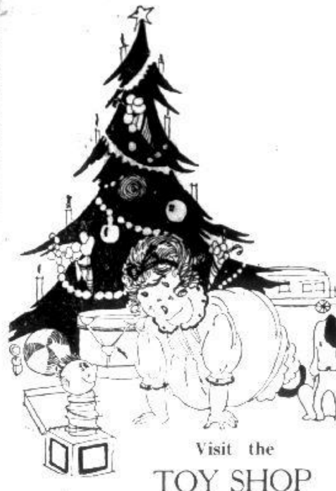
Visit the TOY SHOP

Parents naturally want to give their children something to enjoy, yet something that will last. These are the kind of toys found in our Toy Shop.