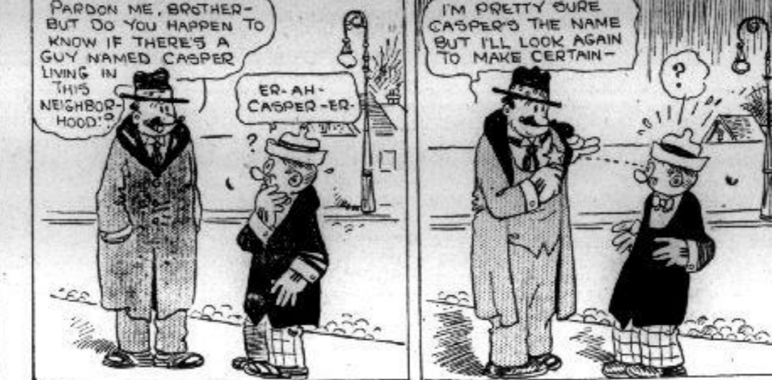
ILL REPORT THAT INFORMATION TO HEAD-QUARTERS—AND WHAT'S NAME? ME? OH, MY NAME IS JONES!