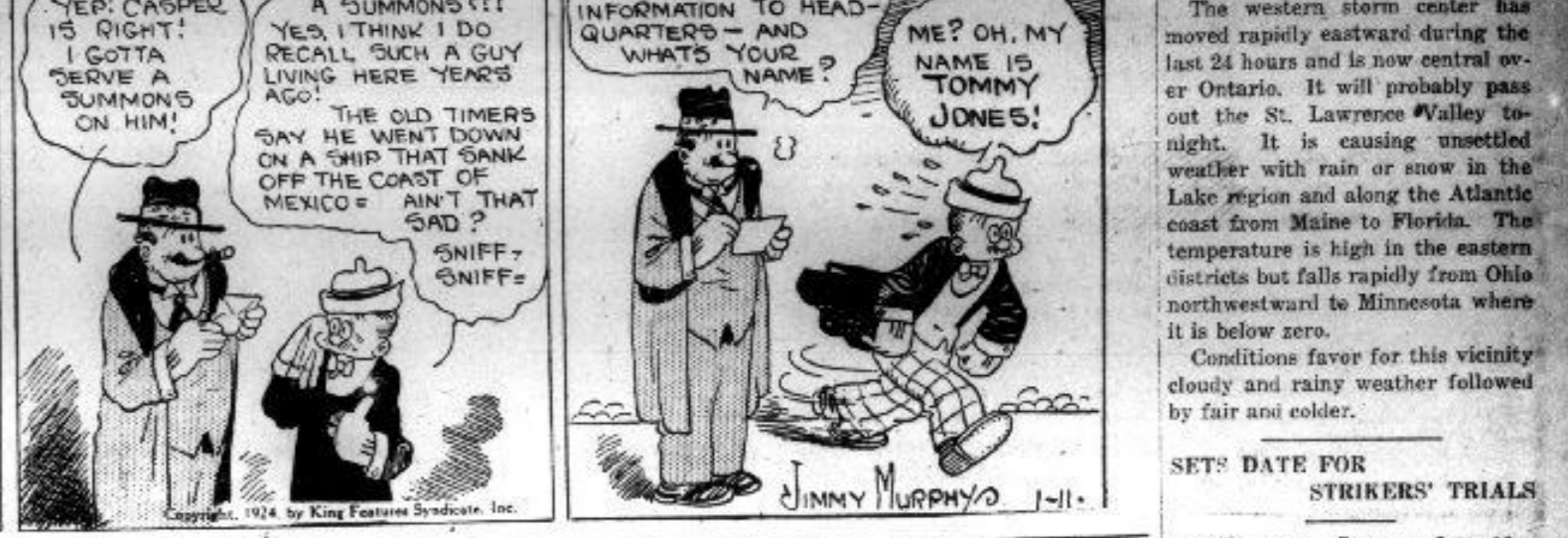
ILL REPORT THAT INFORMATION TO HEAD-QUARTERS—AND WHAT'S NAME? ME? OH, MY NAME IS JONES!