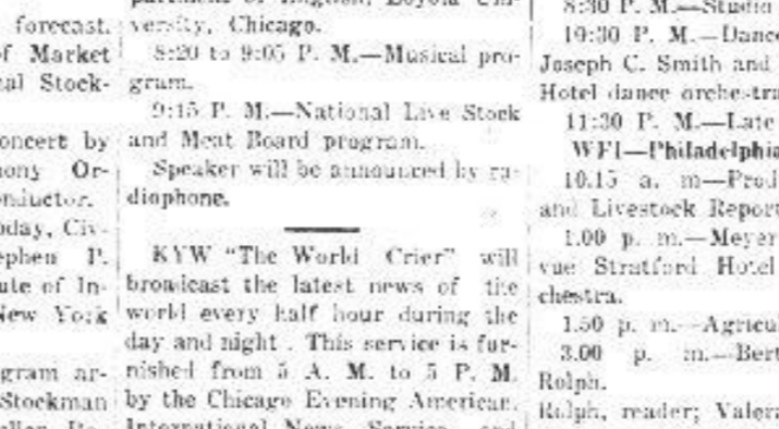
When you're discussing Radio and what hook-ups it's best to bring them into discussion in front of the public, you'll find that it's not so simple as it seems. ...