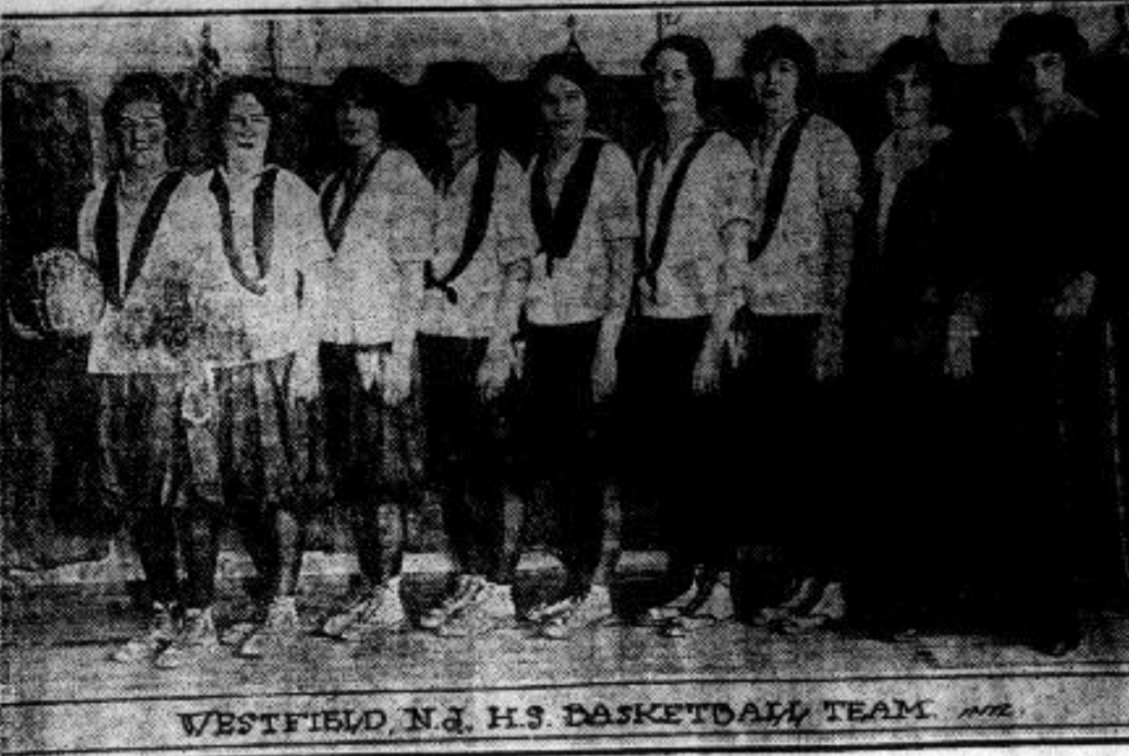
WESTFIELD N. J. STATE BASKETBALL TEAM