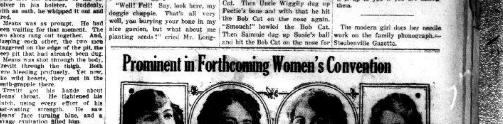
Here are the women behind the Seventeenth Biennial Convention of the General Federation of Women's Clubs, to be held in Los Angeles from June 2 to June 13. An elaborate program has been prepared, and much important work and business is scheduled.