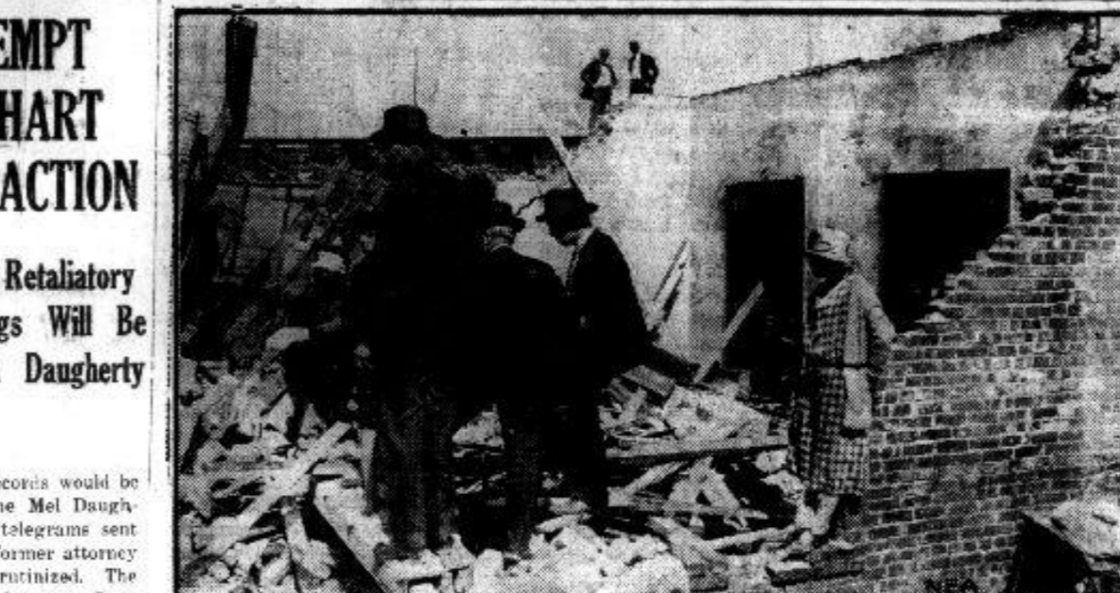
Just one of the many buildings which were demolished when the tornado swept through Greenwich, Conn., last night.