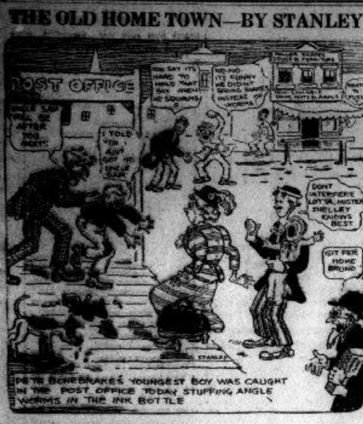
THE OLD HOME TOWN—BY STANLEY