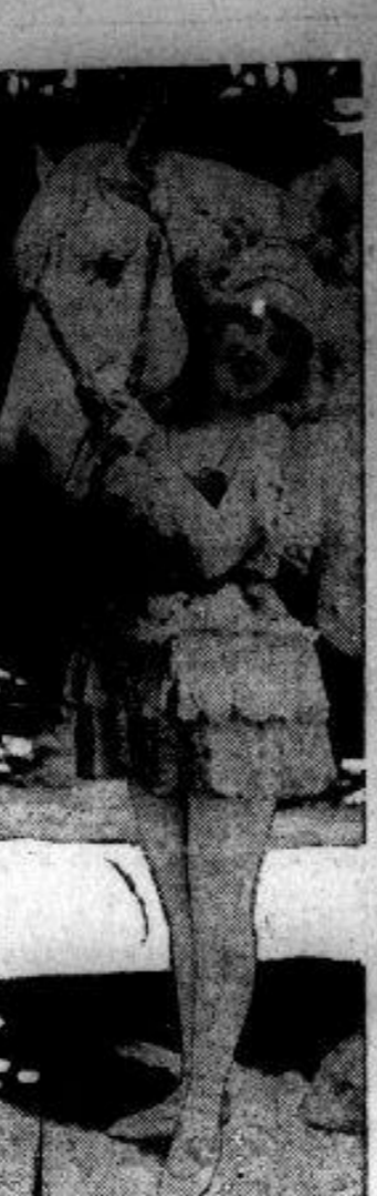
FLORA BEDINE Famous Bareback Rider with SPARKS CIRCUS

GUESS AND WIN FREE RESERVED TICKETS TO THIS BIG CIRCUS MAY 29 First Prize Four Reserved Seat Tickets. 2nd Prize 3 Reserved Tickets 3rd Prize 2 Reserved Tickets