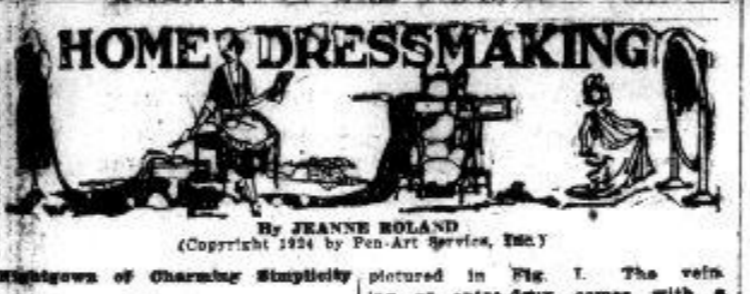
Illustration of a woman sewing at a machine.