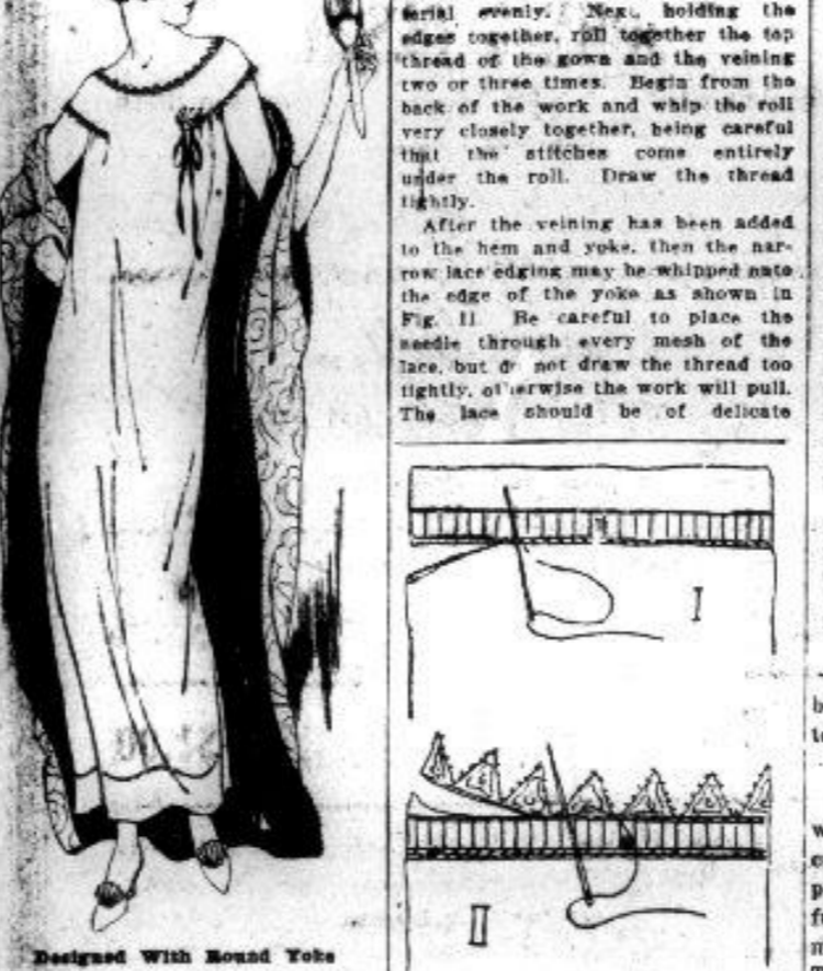
Illustration of a woman in a dress.

Illustration of a woman sewing at a machine.