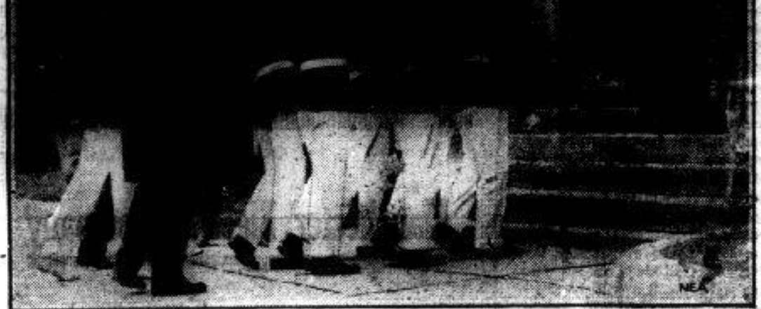
AT THE END OF THE TRAIL—First and exclusive picture of the funeral of Calvin Coolidge, Jr., son of the president of the United States as the flower-banked casket was carried by U. S. Marines into Edwards Congregational Church at Northampton, Mass., where the boy was known by everyone. Thousands lined the streets as the procession moved to and from the church. Cabinet officers and men and women high in the affairs of the nation attended the ceremonies. The Daily News is enabled to print pictures of the Northampton funeral first because of airplane service engaged by it and NEA Service.