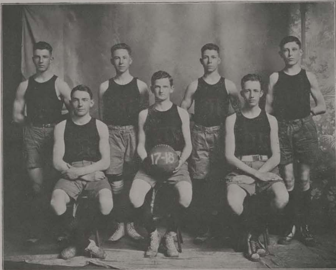
SENIOR BASKETBALL TEAM.