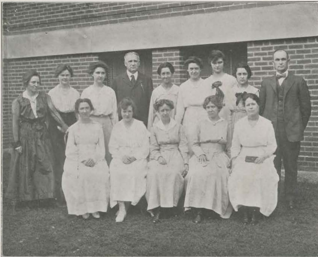
S. M. H. S. FACULTY 1917-'18