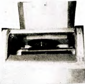
TWO PIECE ORCHESTRA