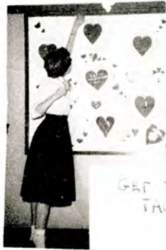
GET THAT TACK