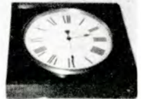
THIS IS THE END BECAUSE IT IS TIME TO GO