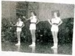
SPORTS NIGHT TWIRLERS