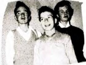
THE BIG THREE SECRETARY- PRESIDENT- VICE PRESIDENT (L.-R)