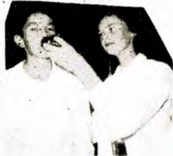
COKE TIME B.J.H.S.