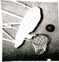
ANOTHER TWO POINTS FOR BARNARD