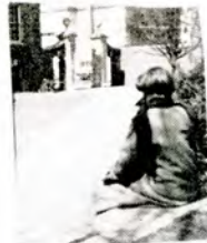
THOUGHTS OF THE FUTURE