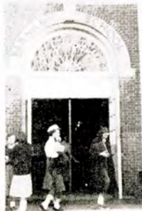
A SCHOOL DAY ENDING