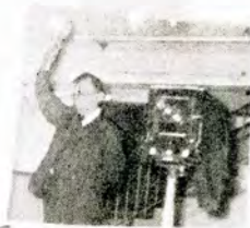
THE PICTURE BEHIND THE PICTURE