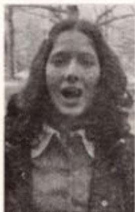
KEEP YOUR MOUTH SHUT - WE'VE HEARD ENOUGH!!