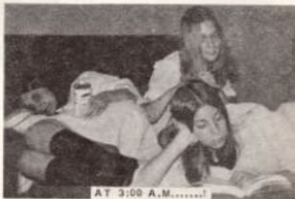
AT 3:00 A.M. ....!