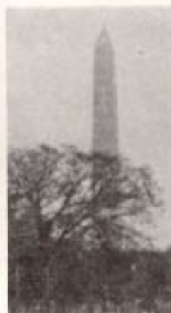
THE WASHINGTON MONUMENT