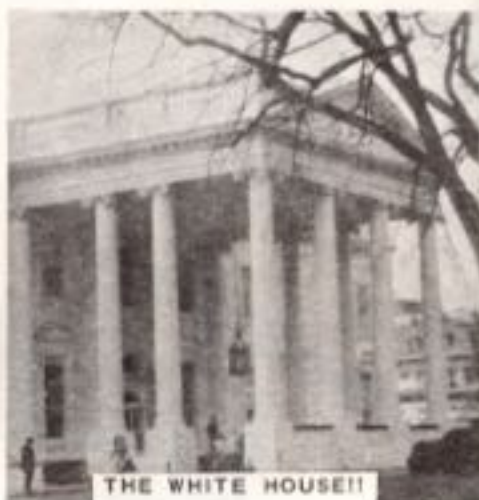
THE WHITE HOUSE!!