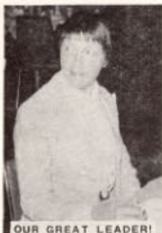
OUR GREAT LEADER!