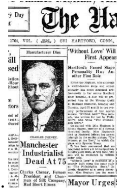
Obituary on page 1, Hartford Courant.