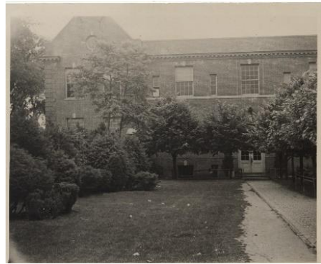
1942, Educational Square, looking at Franklin Building. These and the school building across the street were used for both junior high and high school at that time.