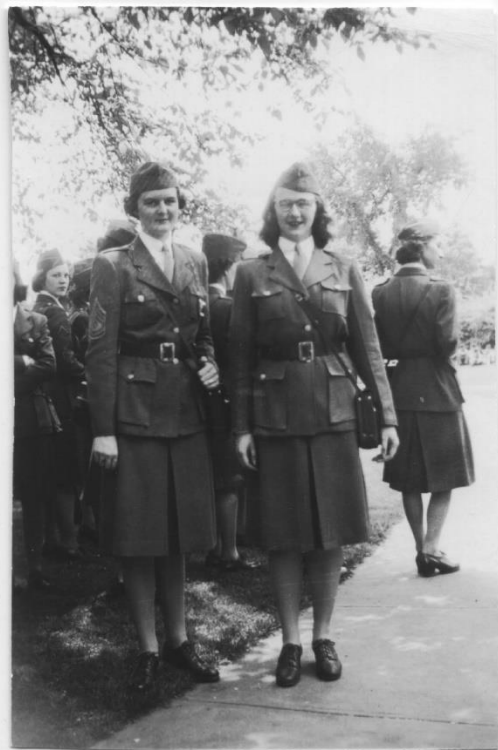
Other members of the Civil Defense Council, 1943.