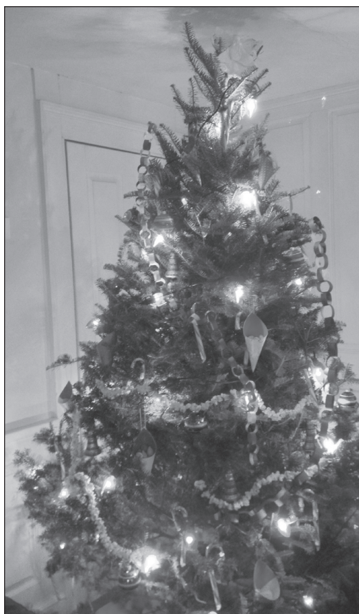
Decorated tree at the Cheney Homestead Open House.

The annual Open House in early December at our museums was another big success. The efforts of many of our volunteers helped to make it so. Special recognition is given to the Manchester Garden Club for their efforts in decorating the Cheney Homestead for the holidays, as they have done for many years. Visitors remarked on how attractive the decorations were and the warm feeling they evoked at the old house. The trolley that carried visitors from museum to museum was really appreciated and made it much easier to visit all the sites.