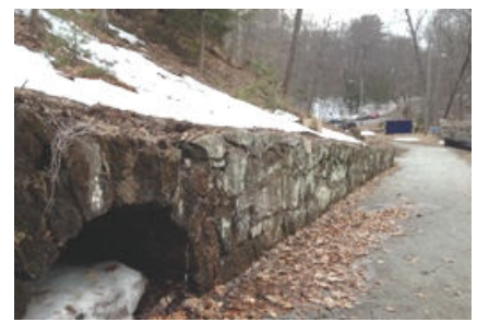
Contemporary photo of wall