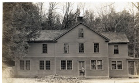
Highland Park water bottling plant, circa 1917