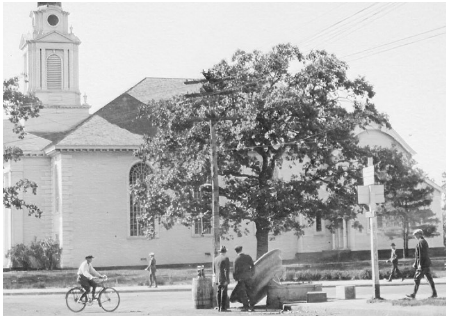
This was the scene on the morning of September 25, 1922 with the Revolutionary War Memorial fountain knocked from its base.

The motor car struck the massive fountain squarely toppling it and breaking free the sphere atop the center column sending it flying across the eastbound lane of East Center Street where it came to rest against the Odd Fellows' building.