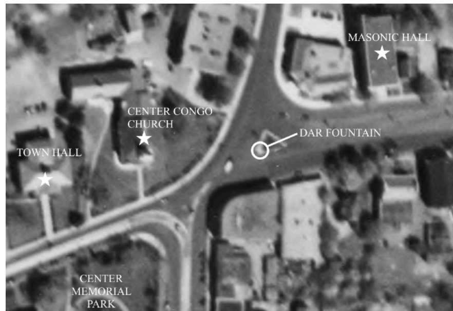
An aerial photograph of Manchester's Center from 1934. Note the triangular Isle of Safety located at the joining of East Center and Main Streets where the fountain was originally placed.

In 1915 Orford Parish, Daughters of the American Revolution, announced their plans to erect a memorial fountain at Manchester's center to honor the memory of those of Orford Parish who fought in the Revolutionary War. It would be a marble fountain, located on the western point of the triangular park that sat out in the middle of East Center Street.