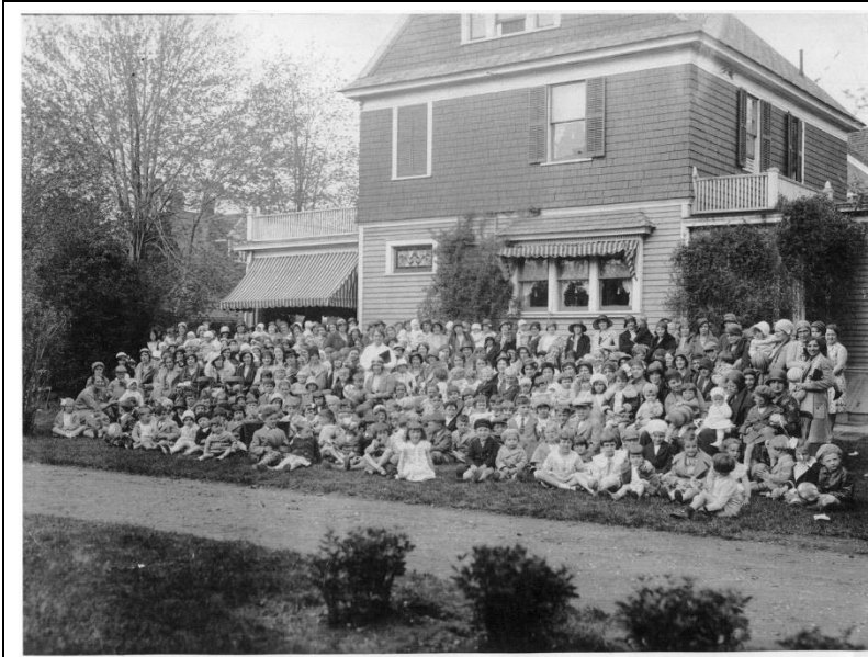
Contemporary photo of the house, 52-54 Wadsworth St.