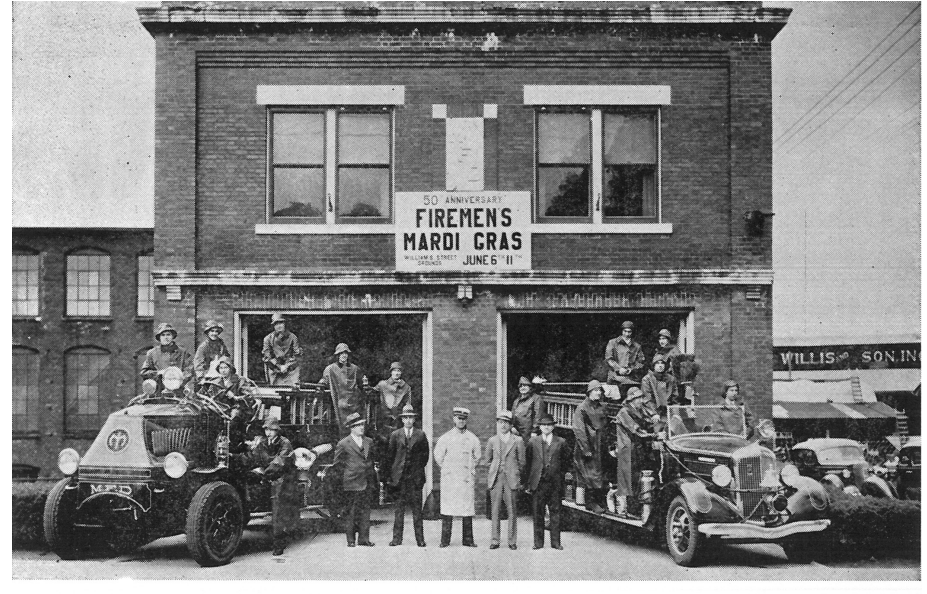
MANCHESTER FIRE HOUSE AND APPARATUS

Anyone who has visited our History Center has seen the 24 feet wide panoramic photo of Depot Square taken in 1923. That shows what was the business center of town for many years, thanks in large part to the arrival of the railroad. Locating the depot there was made possible by the donation of land for it by several North End businessmen. Before the